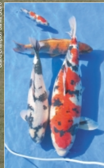
Grand Champion Sanke Size 6