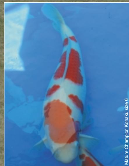
Mature Champion Kohaku size 6