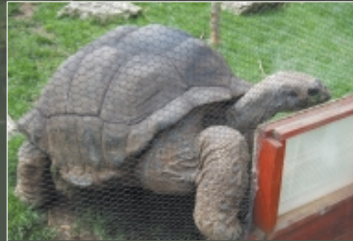
Galapagos tortoise at Lady Rothschild's estate

There were 324 koi in 40 vats benched in the 13 BKKS show classes; 800ft of marquees housing 44 dealers and crafts, six independent food vendors. A total in excess of 3500 visitors attended the show this year, not including the NVN guests. In addition, a contingent from the new Belgian koi club, Koi@home paid us a visit. Their focus is very much on the use of the