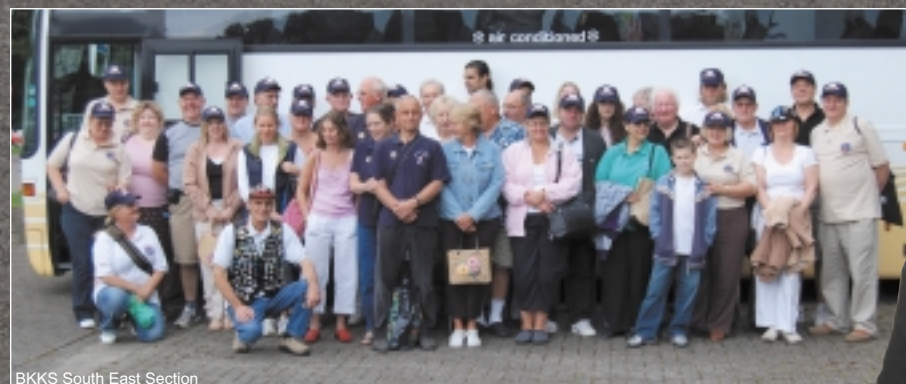
BKKS South East Section

The statistics for this show were impressive: 72 show vats containing 596 koi; 132 dealer stands, and a total footfall for the whole three days expected to be a few short of 25,000. The judges came from six different countries — Australia, Belgium, Japan, South Africa, Taiwan and the UK. The British contingent ▶