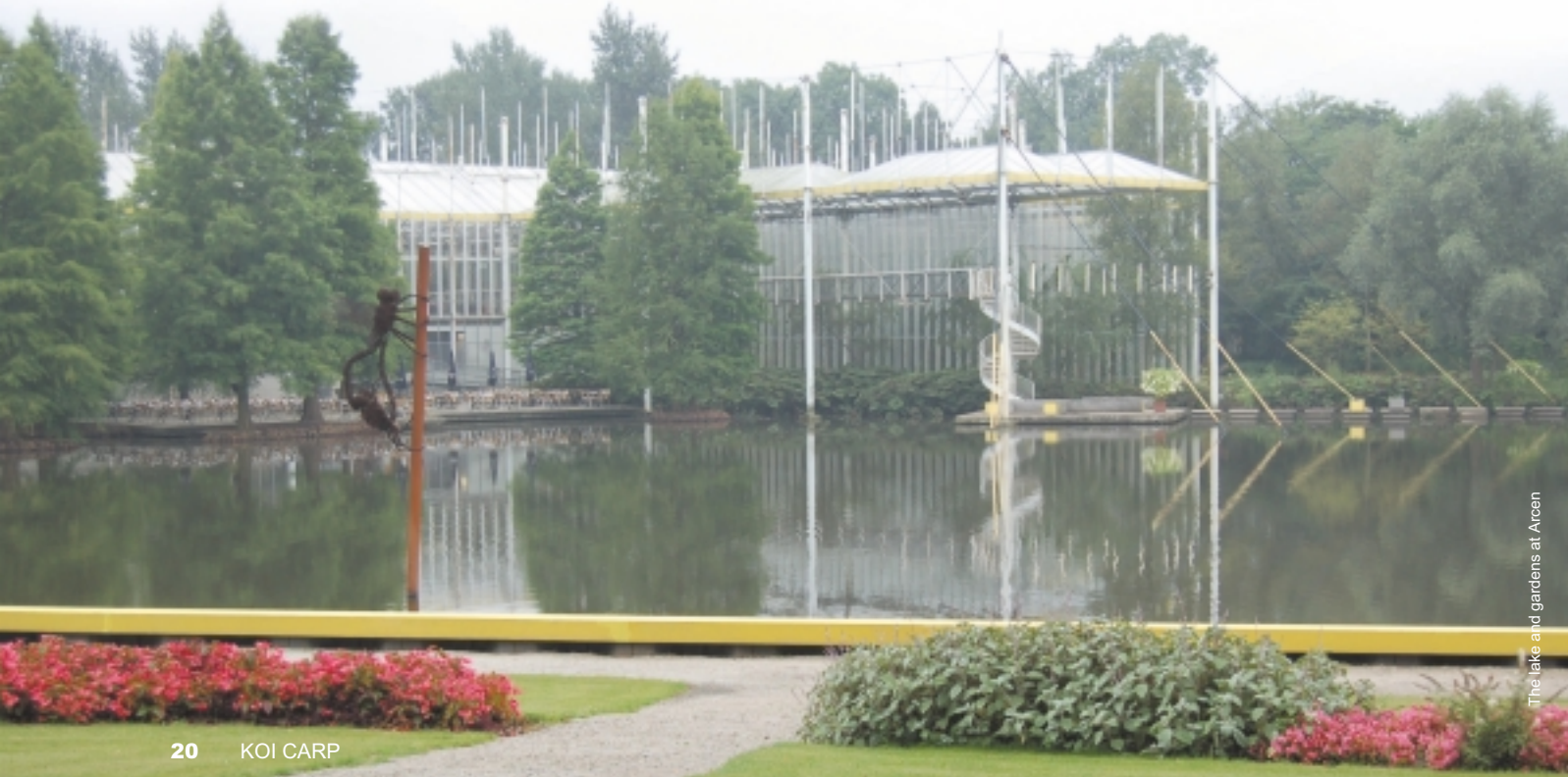
The lake and gardens at Arcen