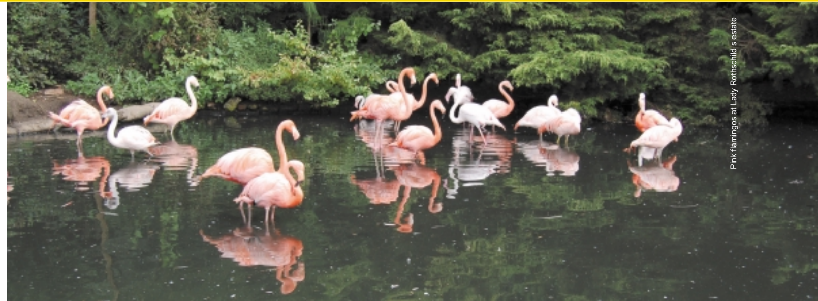
Pink flamingos at Lady Rothschild's estate

These few words just scrape the surface of what is now, and has been for several years, the biggest koi show outside of Japan. Hopefully the accompanying pictures fill in the many blanks.