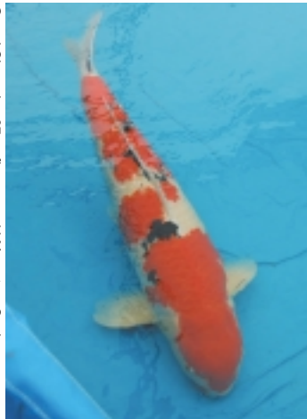
Grand Champion 87cm five-year-old Momotaro Sanke

These two awards typify two of the main differences between the Dutch National and any UK show. Firstly, a similar fisheries health status allows the movement of fish between Holland and its neighbouring countries, thus making the NVN show the European National. Secondly, they allow dealers and hobbyists to compete together. Indeed the dealer contingent accounts for over two-thirds of the vats booked at the show.