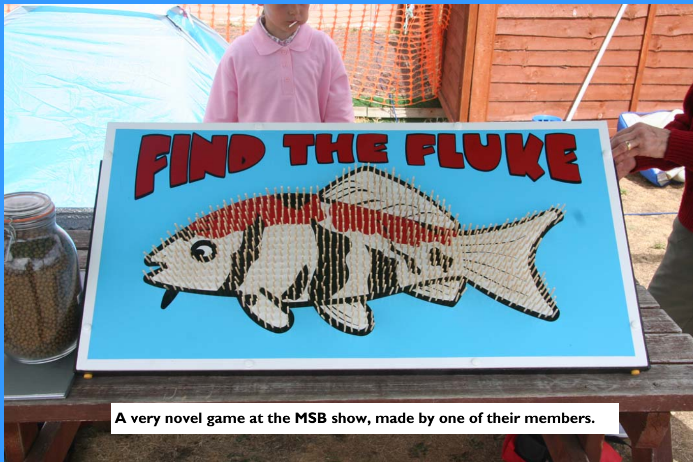
A very novel game at the MSB show, made by one of their members.