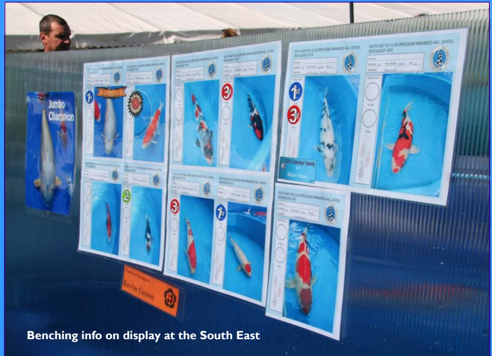
Benching info on display at the South East

However, that doesn't stop the SE from enjoying the benefits. With a bit of teamwork on our part a copy of our show flyer was brought over and put on display for all to see.