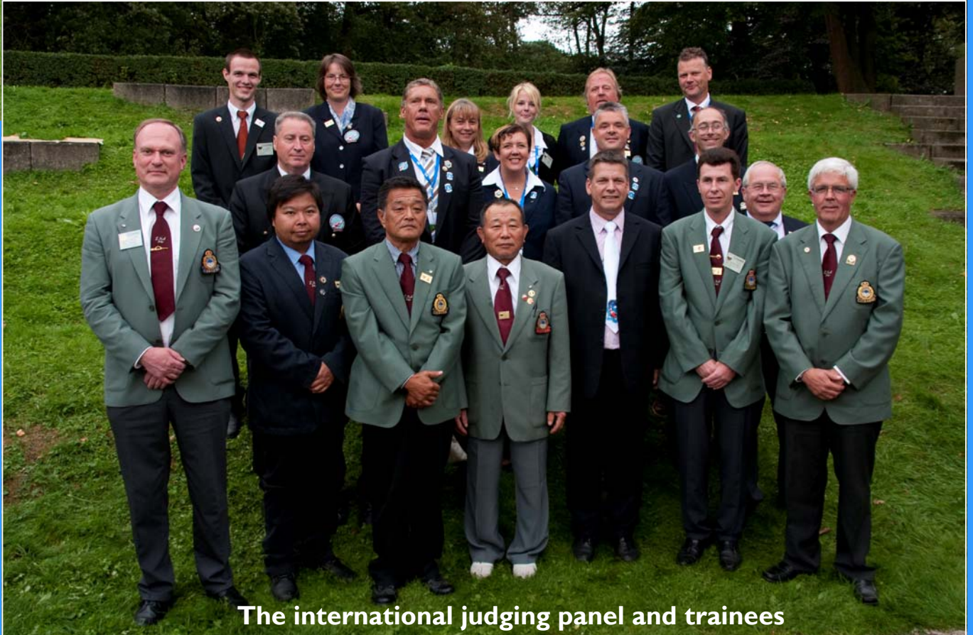
The international judging panel and trainees