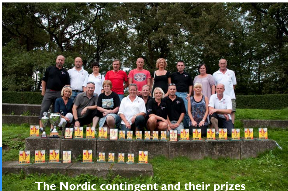
The Nordic contingent and their prizes

I don't believe that any article on the Holland Koi Show could ever do justice to the spectacle that it is and the immense amount of time and effort that goes into organising and running a show of this size. To everyone who made my stay such an enjoyable one a huge thanks. I hope that the photographs accompanying this article will give readers some small insight into this magnificent show. As they say a picture is worth a thousand words!