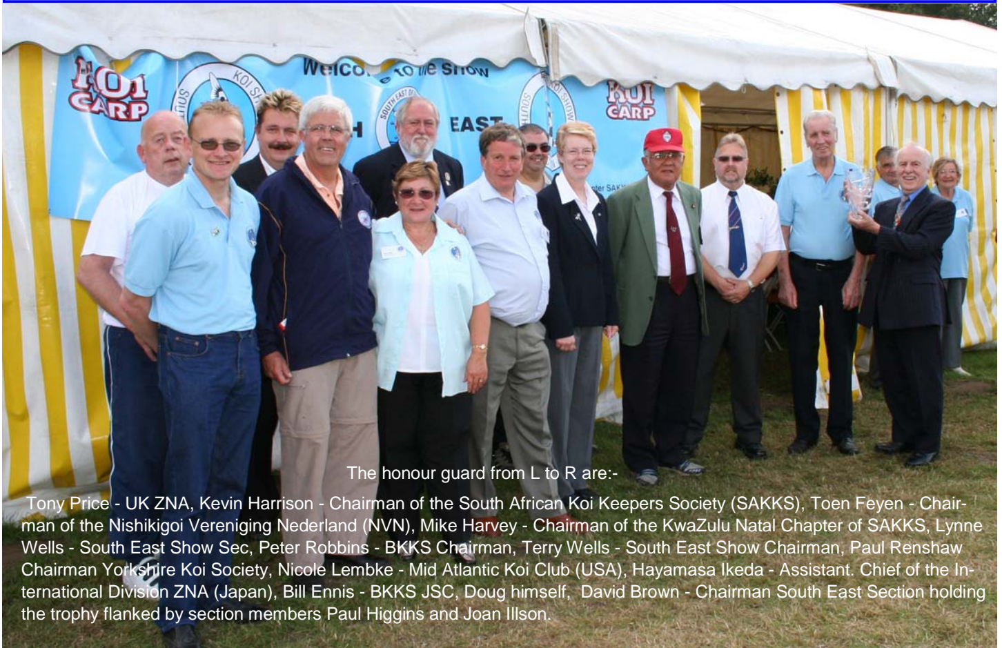
The honour guard from L to R are:-