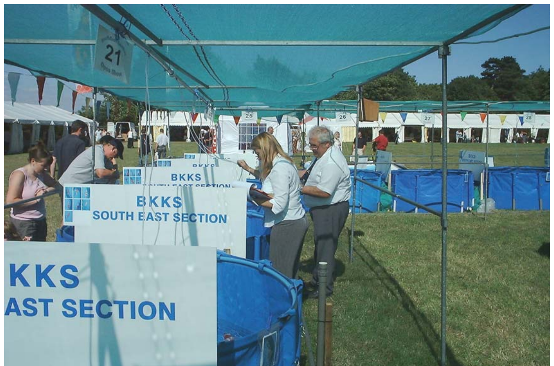
Splash screens in position at South East 2005.