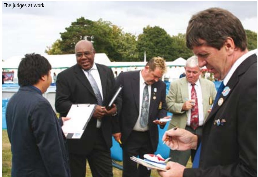
The judges at work