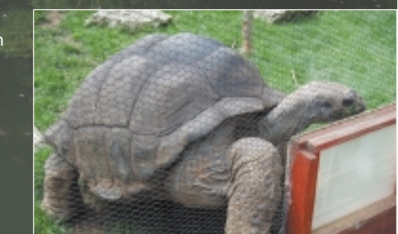
s tortoise at Lady Rothschild s esta

The MSB ponds had been carefully chosen to add interest